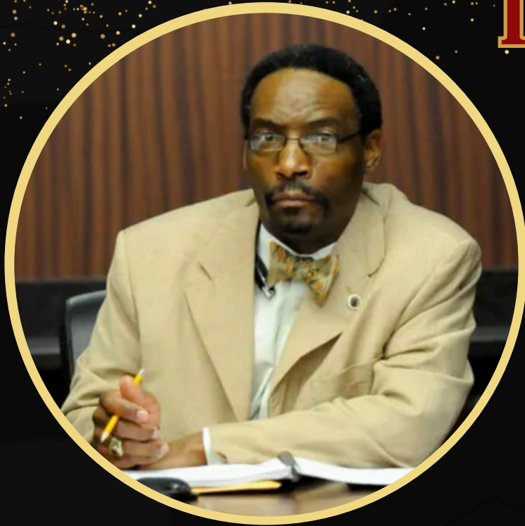
JUDGE MARVIN WIGGINS